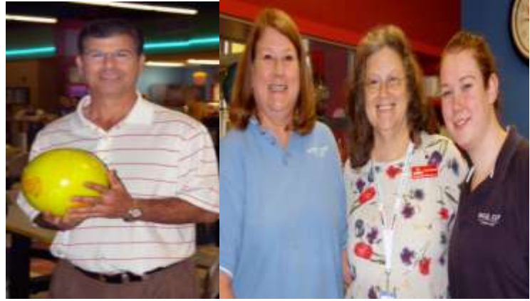
Middle GA {Warner Robins} Tournament host for 2011