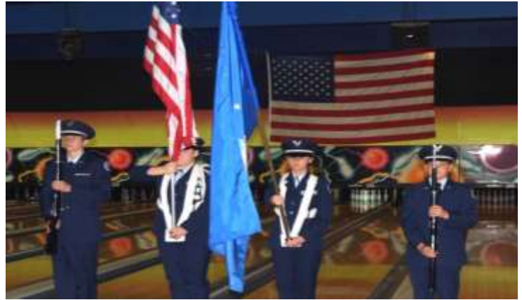
Opening Ceremonies During Youth State Tournament, 2011

In closing, we truly appreciate and thank all coaches, parents and association leaders for the work they do in support of our youth!