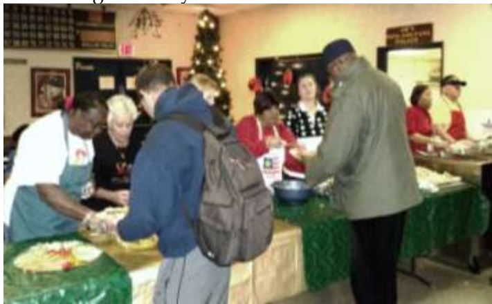
The American Legion Post 205 supports our efforts by providing their facilities for us. These Veterans are transported from our local uptown branch of the Charlie Norwood VA Medical Center where they are undergoing treatment. Local bowlers provide Christmas gifts of socks, combs, toothbrushes & handkerchiefs. We appreciate all who help with this event. They say they enjoy & feel honored to be serving & meeting our hero's to whom we owe so much. The smiles on the Veterans faces put all of us Volunteers in the true Christmas Spirit by giving.

The Augusta women & men bowlers prepare & serve a traditional Thanksgiving/Christmas Dinner to approximately 225 Veterans & their attendants. We cook on Sat & Sun & then have the dinner on the 1^{st} Monday in Dec each year. This is a celebration to honor those who give so much for us that we have been doing for 40+ years.